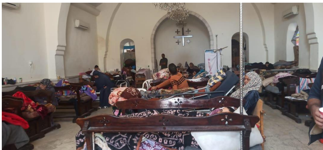
The hospital chapel, used as vital extra space for inpatients and their families

The hospital is now at the centre of a catastrophic public health situation. Many of the patients are chronically ill, suffering from the dire conditions in overcrowded camps where access to water and sanitation has been severely limited. Until recently, ongoing air strikes had prevented even nearby residents from accessing care, but with this pause in hostilities, Al Ahli is now receiving an influx of about 600 patients a day, in addition to about 130 inpatients - with families of patients also being accommodated on-site. Many dedicated hospital staff have lost their homes and are now sheltering either at the hospital or at the nearby Holy Family Catholic Church. Along with the Greek Orthodox Church of St Porphyrius, the church continues to provide shelter to scores of families whose homes have been destroyed.