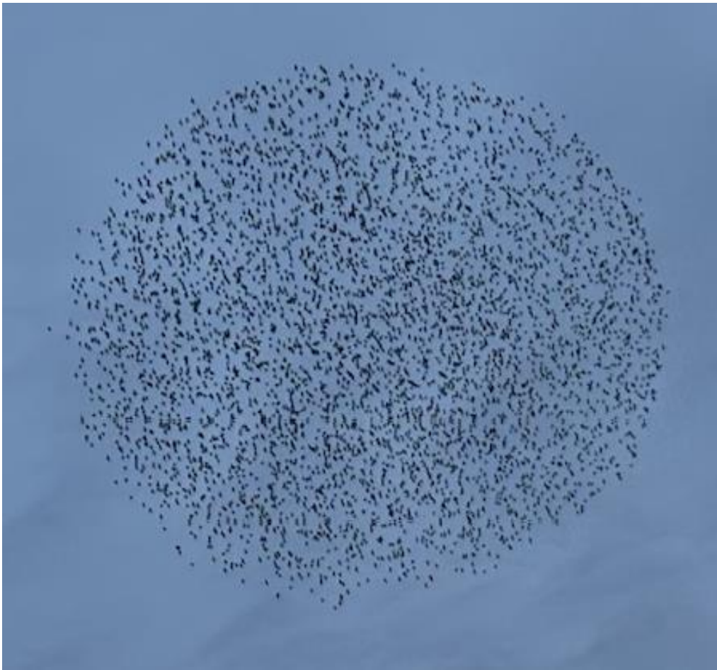
Starling Murmuration ~ Northern Bury St Edmunds at about 5pm, 5 February 2025

Please forward this to anyone you know who might not be in our Google group. For information about us please visit: www.northburychurches.org.uk