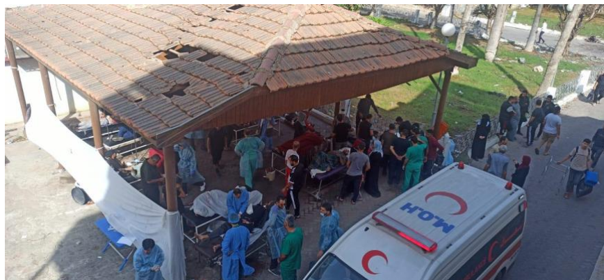
Emergency triage area in the courtyard of the Al Ahli Hospital

One of the critical institutions that Mosaic will be supporting through our new partnership is the Al Ahli Hospital. The recent ceasefire is allowing many Palestinians to seek treatment at Al Ahli after many months with virtually no access to healthcare. In response to the overwhelming need for emergency care, the hospital's chapel has been repurposed to accommodate inpatients, while Red Crescent ambulances are transporting patients since the hospital's own ambulances were destroyed during the conflict.