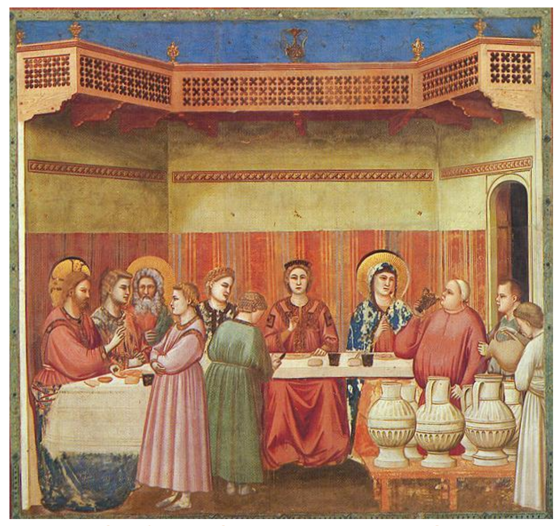
Marriage at Cana, Scrovegni Chapel, Padua

Please forward this to anyone you know who might not be in our Google group. For information about us please visit: <a href="www.northburychurches.org.uk">www.northburychurches.org.uk</a>